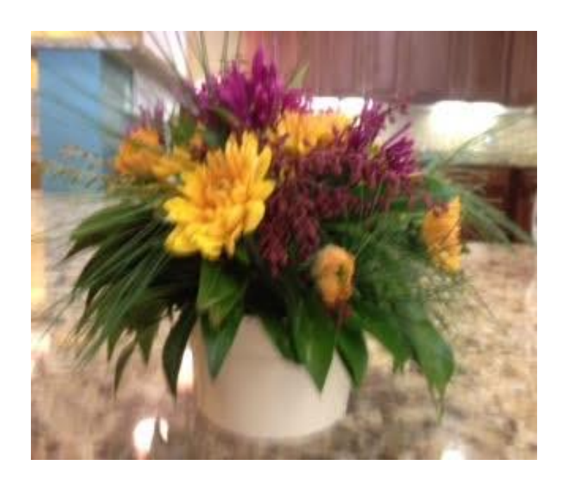
Halloween at Ashland Farms Assisted Living