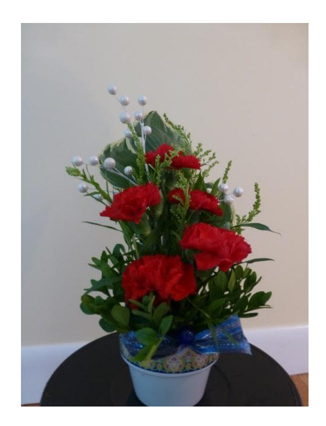
July 4th at Ashland Farms Assisted Living