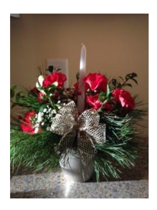
Holiday at the Senior Center