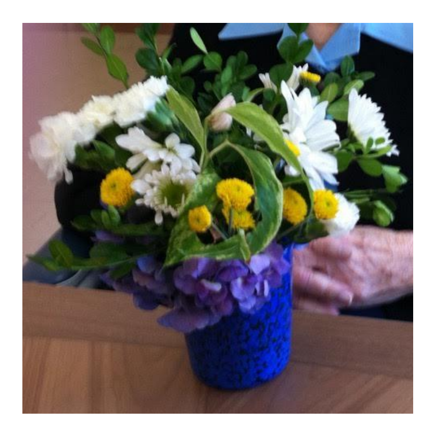
Spring at Presentation of Mary