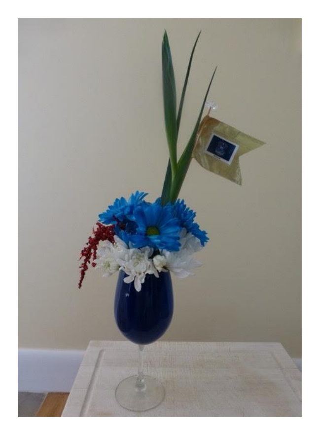
Flag Day at Brightview Wellspring