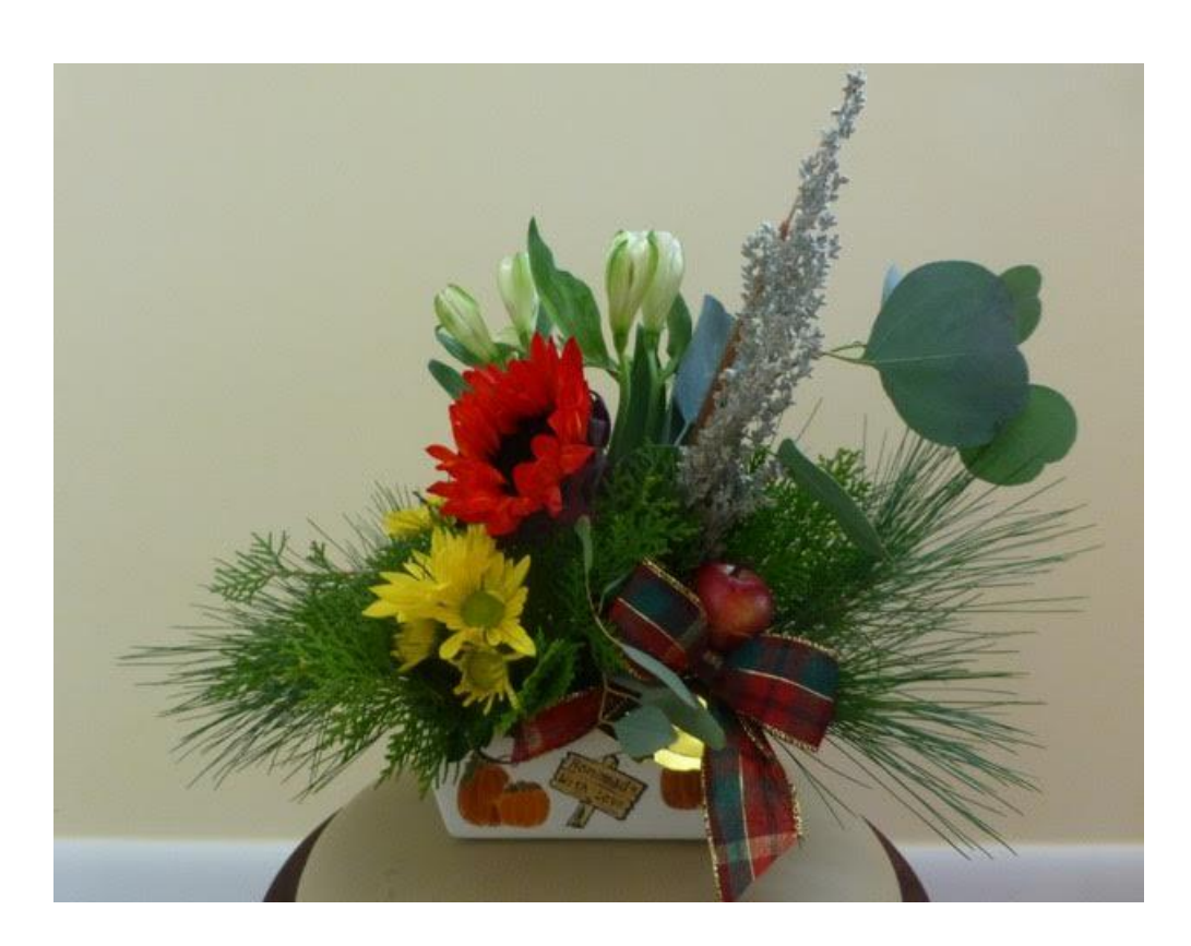
Thanksgiving at Brightview Wellspring