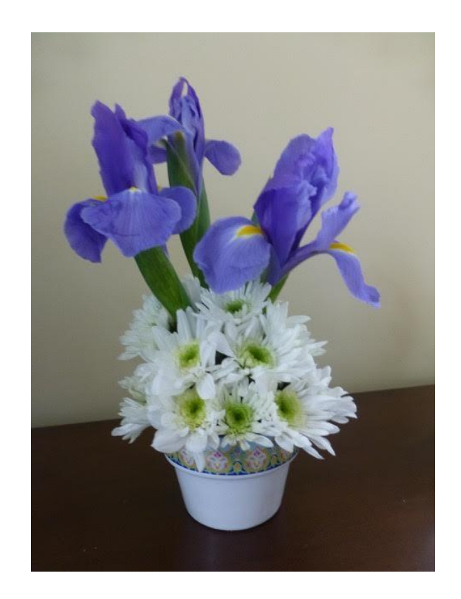
Spring at Ashland Farms Assisted Living