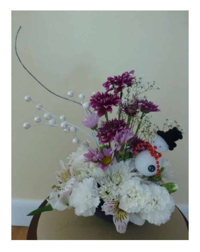
Winter at Brightview Wellspring