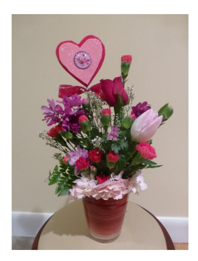
Valentine's Day at Brightview Assisted Living