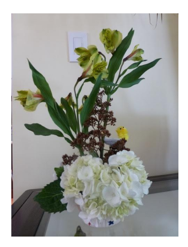
Spring/Easter at Ashland Farms Assisted Living