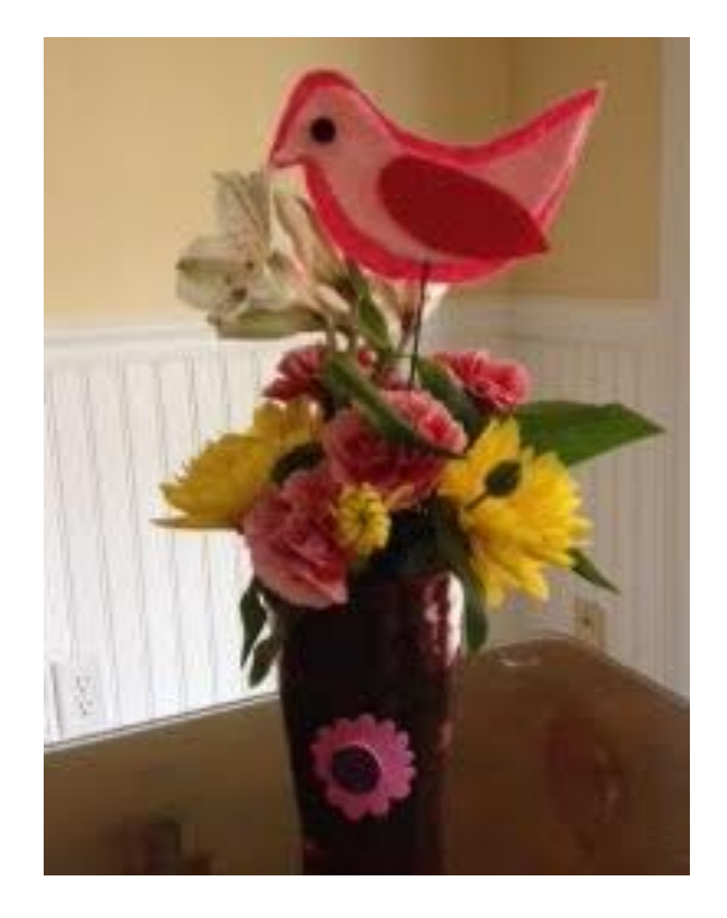
Spring at Brightview Wellspring