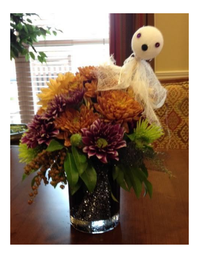
Halloween at Brightview Assisted Living