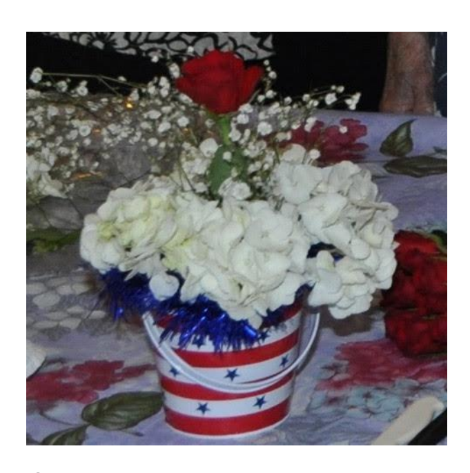
July 4th at Ashland Farms Assisted Living