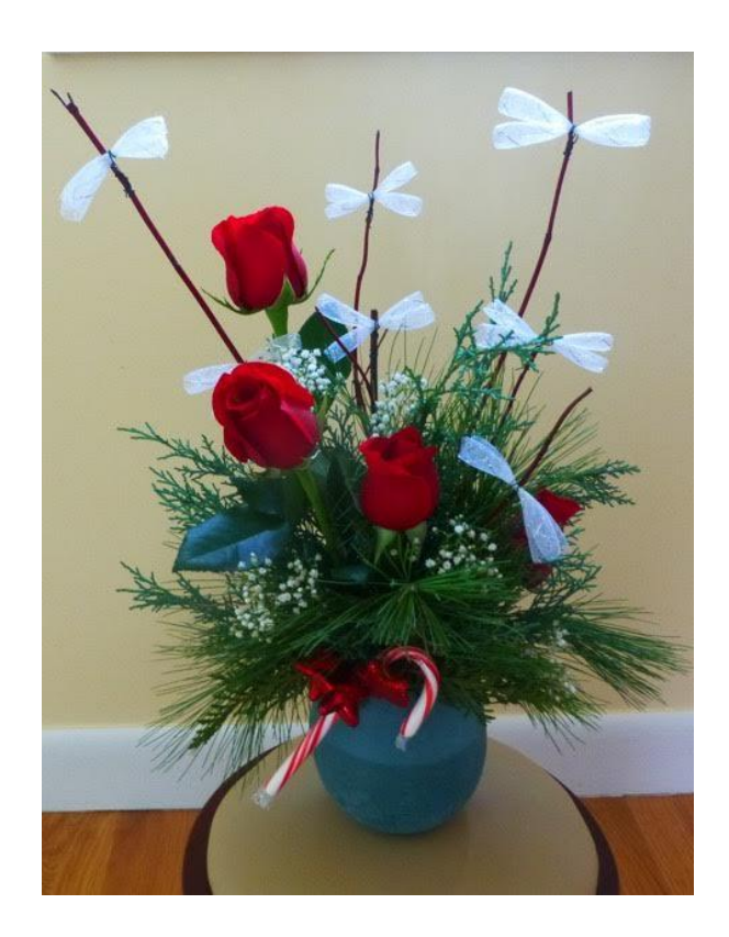
Holiday at Ashland Farms Harbor Unit