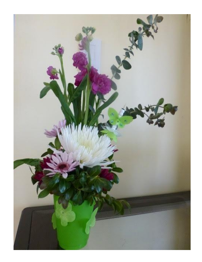
Spring at Brightview Wellspring