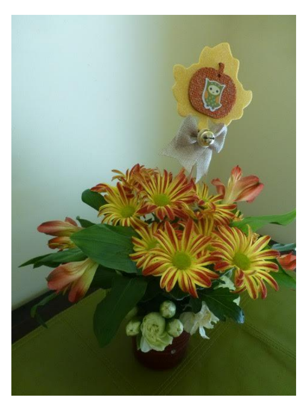
Fall at Brightview Wellspring