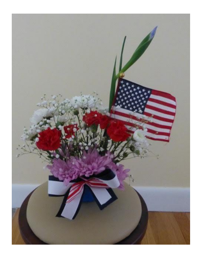
July 4th at Ashland Farms Harbor Unit