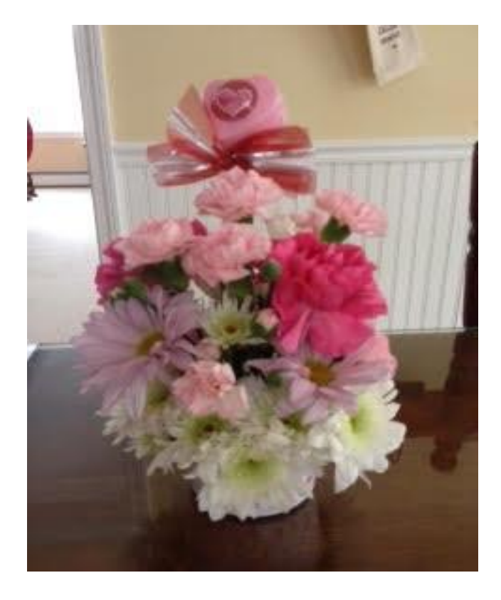
Valentine's Day at Brightview Wellspring