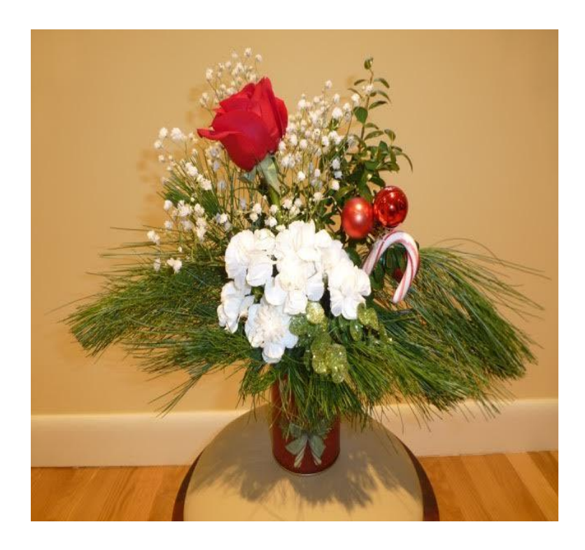
Holiday at Ashland Farms Assisted Living